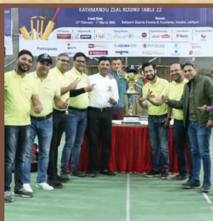
KZRT22- Indoor Corporate Cricket Tournament