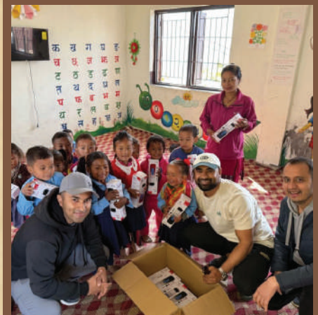
KMRT4 Distribution of Flasks, Sports Equipment's