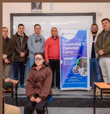
BTRT28 Eye Screening