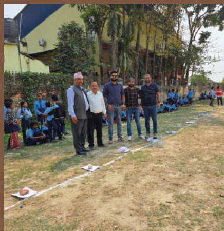
BRT5 organized a certificate distribution program