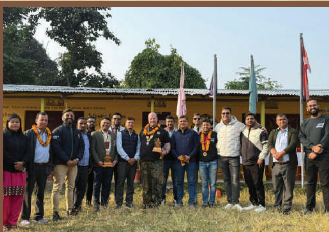
DRT26 Inauguration of Pashupati Shiksha Mandir

As a testament to RTN's commitment, the RTI President personally traveled across Nepal to inaugurate five newly developed Model Schools. His presence highlighted the importance of investing in education and showcased the impact of collaborative efforts between RTN, communities, and stakeholders. These schools now stand as symbols of progress, giving students the opportunity to learn and grow in an improved academic environment.