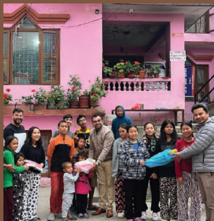
KERT2 Holi Colors and Sweets Distribution Program