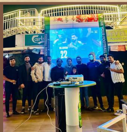
DRT26-Live Screening India VS NZ