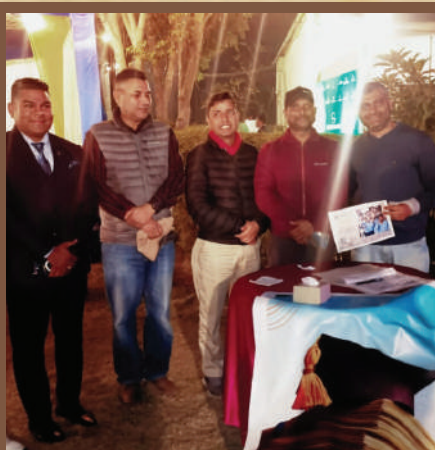
NPRT32 Helping Hand project