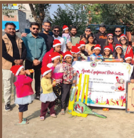
BPRT11 organized Sports Equipment Distribution