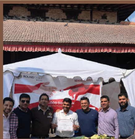
KZRT22 and KTRT25