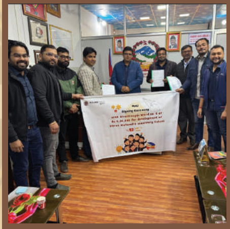
BPRT10 signed an MOU