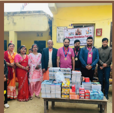
BYRT13 Stationery Distribution