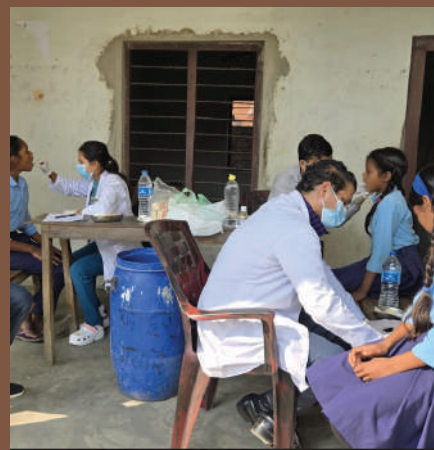
BRT3 Dental Check Up Camp