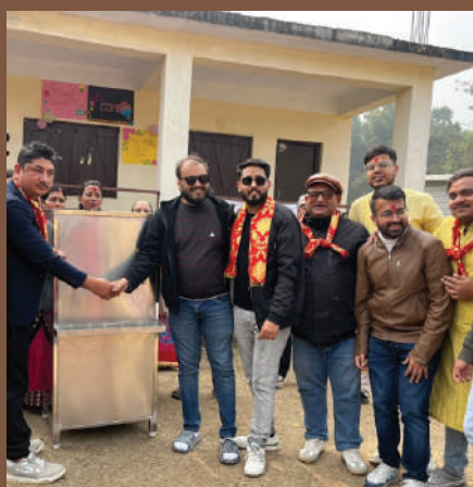
BRT27 Donated a water filter