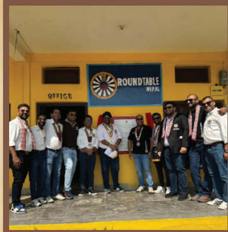
NPRT32 Inauguration of Pashupati Shiksha Mandir