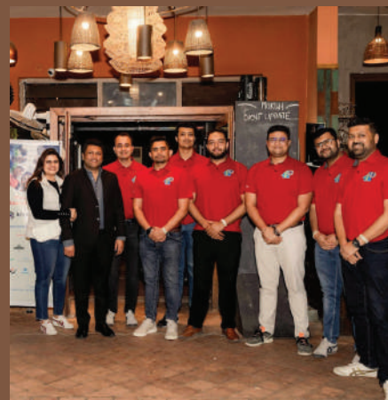
KMRT4-Music for Scholarship & Success