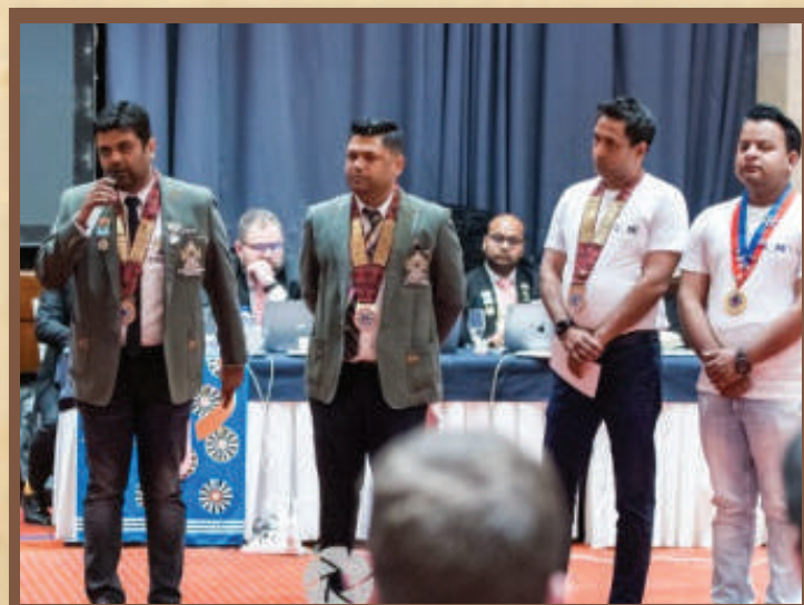
Project Care presented in HYM Cyprus