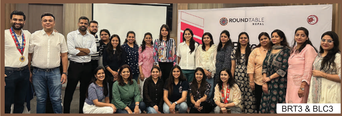
BRT3 & BLC3