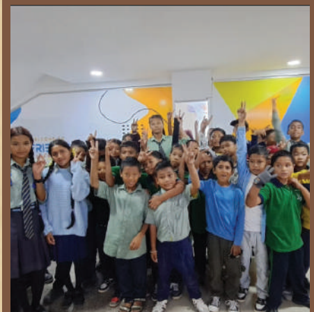
DRT26 Movie screening show