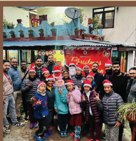
KCRT12 and KTRT25 celebrated Christmas with children