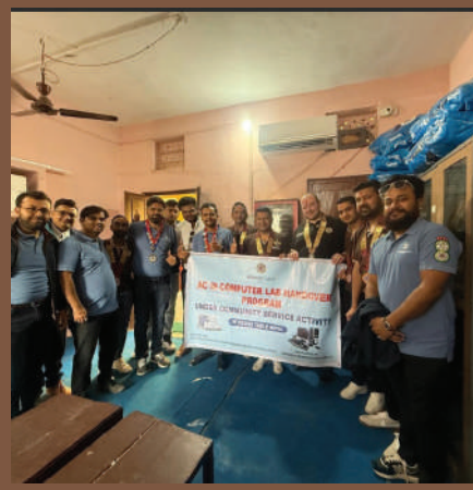
BFRT8 AC Handover Program