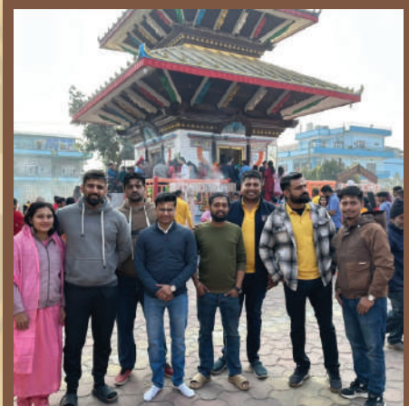
HRT30 Shree Praja Aadharbhut Vidyalaya