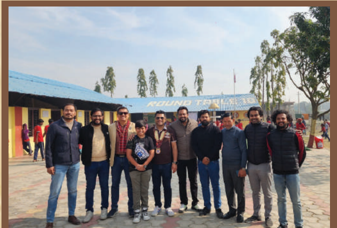
BPRT10 inauguration of Shree Adharbhat Vidyalaya as Model School