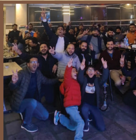
KURT17-Champions Trophy Finals 2025 India VS NZ