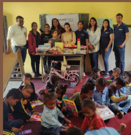
BSRT18 Her Impact