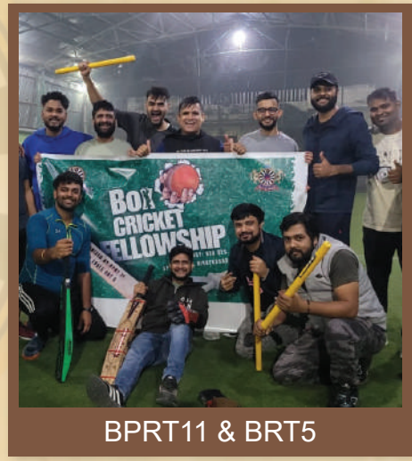
BPRT11 & BRT5