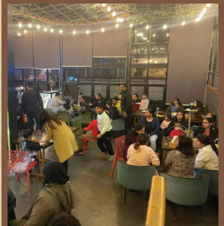
KKRT9-Champions Trophy 2025 India vs Pakistan