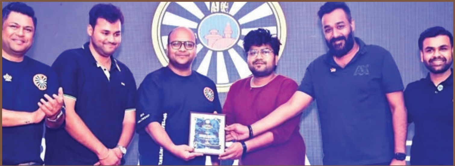
NPRT 32 ,RT Nepal

These events showcased the power of collaboration, friendship, and service, strengthening our brotherhood while making a tangible difference. Let's keep up the momentum as we Live the Legacy