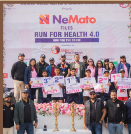
BPRT11-Run for Health 4.0