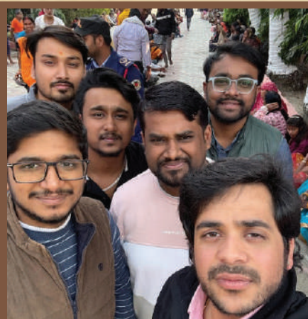
JRT33 Food Distribution