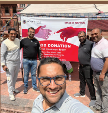
KERT2 and KRRT23