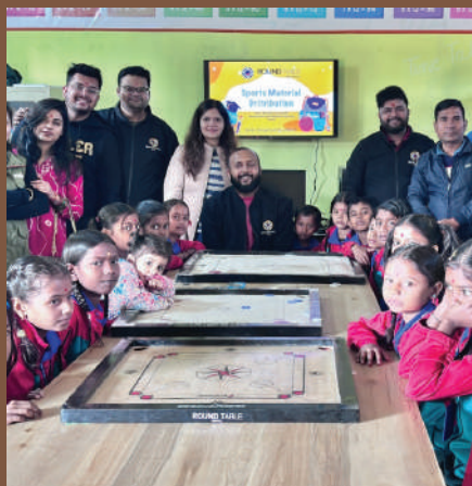
BCRT15 Sports Material Distribution