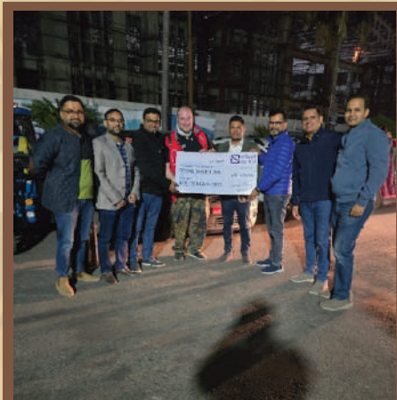
BSRT18-CSR Fund Cheque Handover