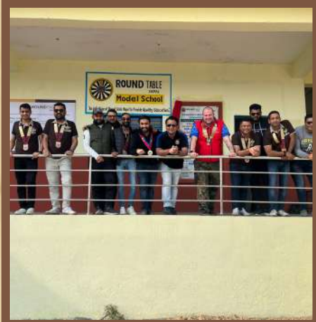
BRT3 inaugurated Shree Nepal Rashtriya Geeta Gajendraraj Joshi Madhyamik Vidyalaya

Model School: Round Table Nepal's Vision for Quality Education