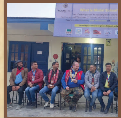
KZRT22 inaugurated Junkiri Public school, Shankarapur as Model School

Education is the foundation of a thriving society, and Round Table Nepal (RTN) is committed to transforming the future of children through its flagship initiative, Model School. Under the Model School project, RTN works closely with communities, local authorities, and educational institutions to upgrade school infrastructure, provide essential learning materials, and enhance teaching standards.